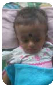
Figure 1: Non Contrast Computed Tomography scan showing Lobar holoprosencephaly with fused Thalamus